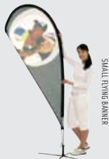
SMALL FLYING BANNER