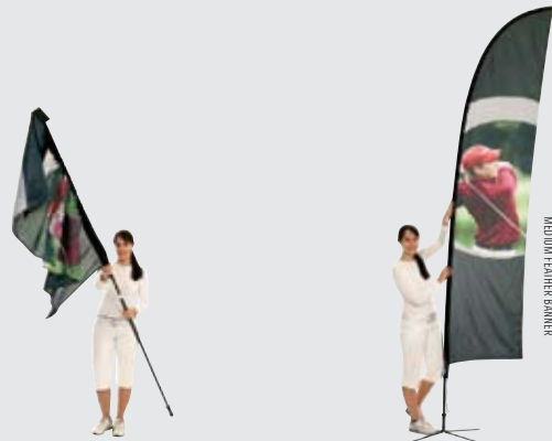
MEDIUM FEATHER BANNER

These Banners come with a standard metal stake and are also compatible with our other hardware. The complete unit is supplied in a portable custom made carry bag with a padded compartment for the stake. The poles for the Flying and Wing Banners are interchangeable.